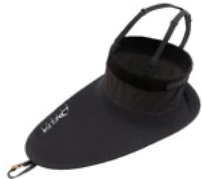
Deluxe Neo/Nylon Skirt Small: 16" x 31.5"