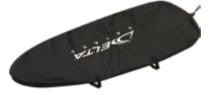
Nylon Cockpit Cover XXL