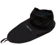
Delta 10AR Nylon Skirt XL: 18" x 36"

We have designed a full complement of genuine accessories to bolster the experience that comes with owning a Delta Kayak. Whether you're looking to keep yourself dry with the addition of a spray skirt for those wet-and-wild conditions, or are looking for a cockpit cover to keep your kayak clean and adventure-ready for your next trip, we've got something for every model of kayak we make.