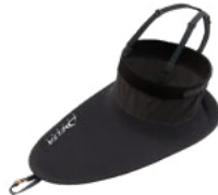
Deluxe Neo/Nylon Skirt Regular: 17" x 32"