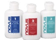
Novus Polish Kit