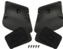
Profile Hip Pad Fit Kit