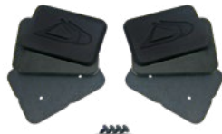
Contour Hip Pad Fit Kit